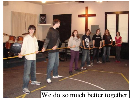
We do so much better together