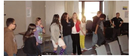
Jr Highers prep for a game