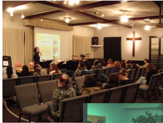
E.P.I.C. Sr High Fellowship