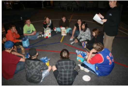
Jr High Christmas Party