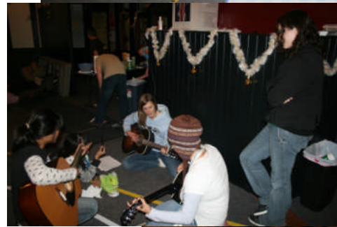
Blankets for Orphans