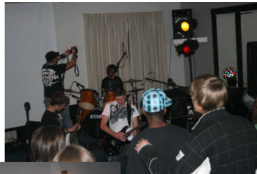
Limbic System Concert