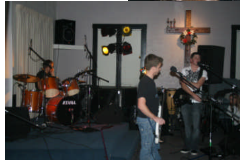
Sr High Christmas Party